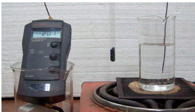
Figure 2. Melting of iodine, the experimental setup: digital thermometer (left), test-tube with iodine (middle) and the glycerol bath with the thermocouple (right).

the behavior of the liquid iodine (obtained a few minutes later).