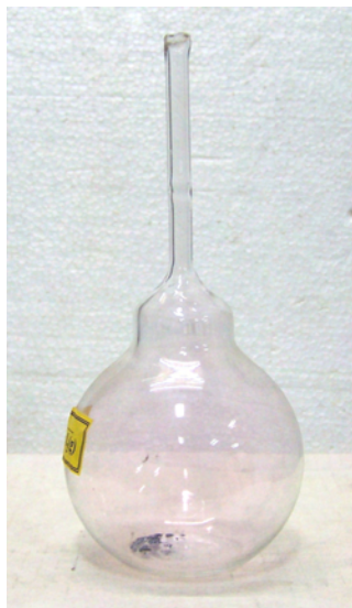
Figure 1. Iodine (both solid and vapor) in a hermetically closed vessel.

tion and the examples given are similar, but heating is not mentioned explicitly.